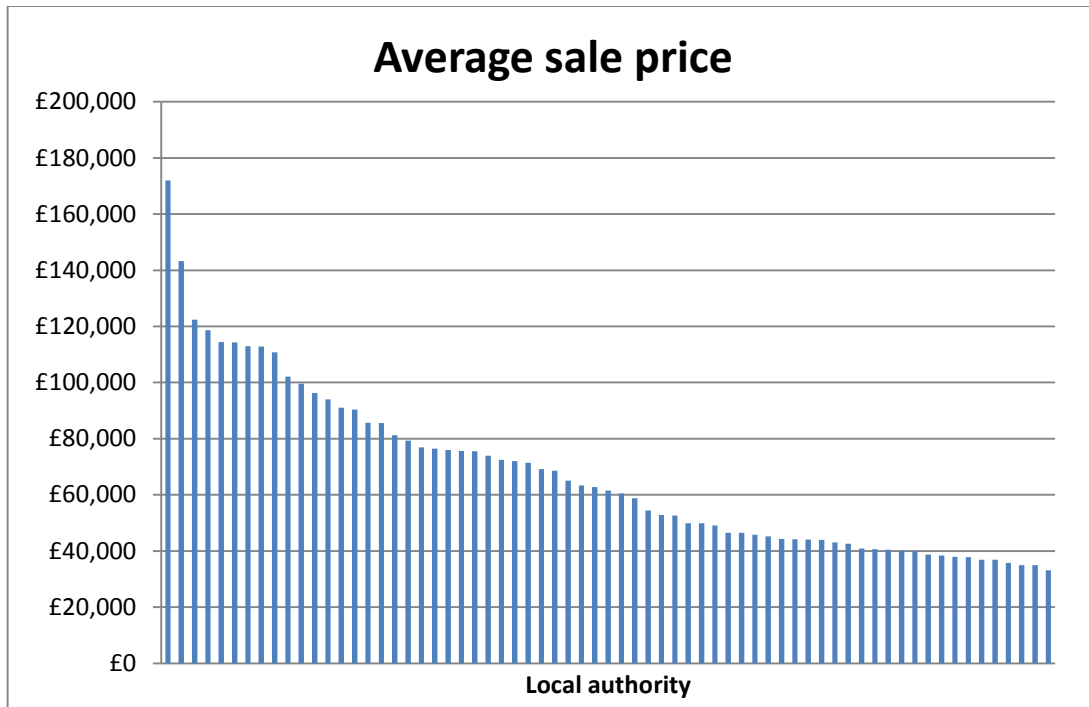
Figure 1: Average sale price